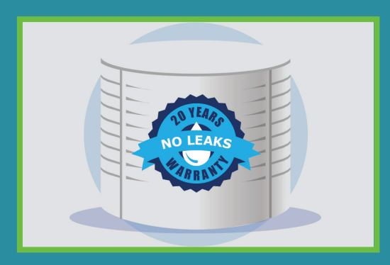
20-Year No-Leaks Warranty