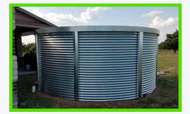
*AquaDot tanks can withstand high wind and seismic activity. Their design is not appropriate for use in situations with significant snow load however. Please see the specifications below for more information. In the case of locations with a sizeable snow load, we have other options available for you. Please ask us.