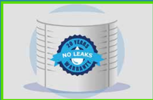
20-Year No-Leaks Warranty