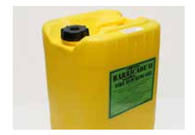
Non Toxic Fire Retardant Gel

Thermal-protective coating to prevent structures from burning