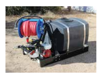
Water Skid Sprayer