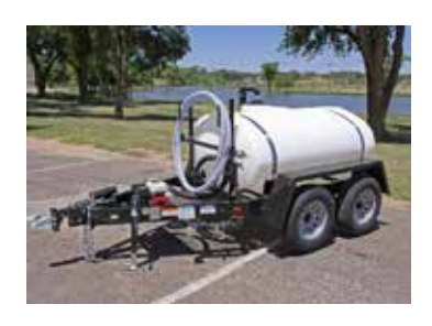
Express Water Trailer 500 gallon DOT-rated water sprayer trailer

Thermal-protective coating to prevent structures from burning