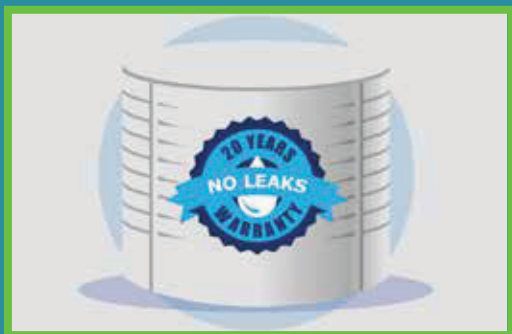
20-Year No-Leaks Warranty