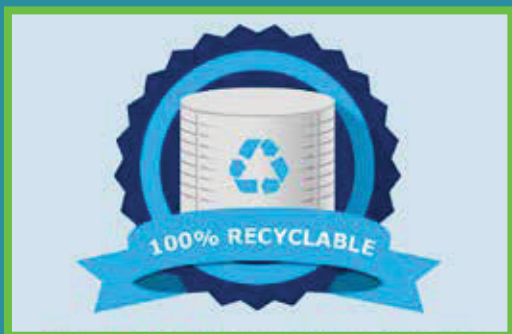
Made from Recycled Steel and are 100% Recyclable