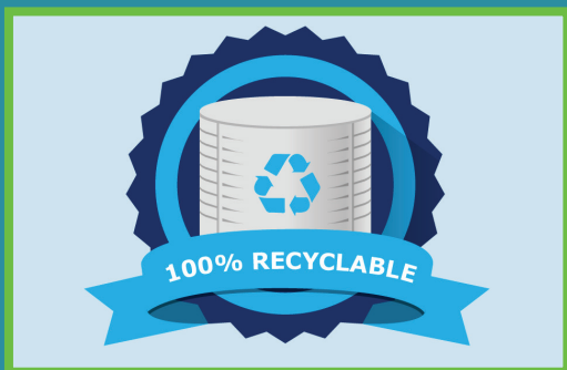
Made from Recycled Steel and are 100% Recyclable