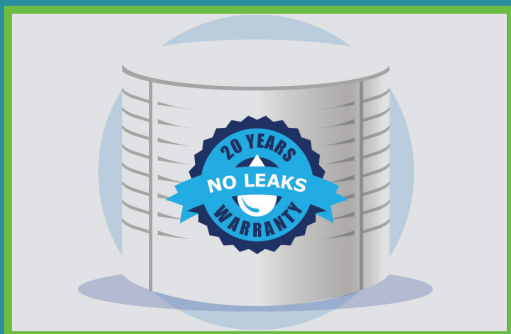
20-Year No-Leaks Warranty