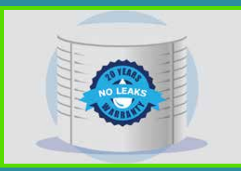
20-Year No-Leaks Warranty