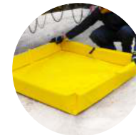
Mini Foam Wall